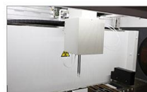
Sample Module Hitech teflon coating probe to prevent cross contamination.