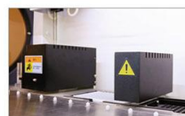
Microplate Reader & Washer Module Modularized automatic control reading and washing system.