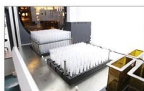
Sample & Reagent & Dilution Rack Module Original sample tubes available; Rack positions programmable.